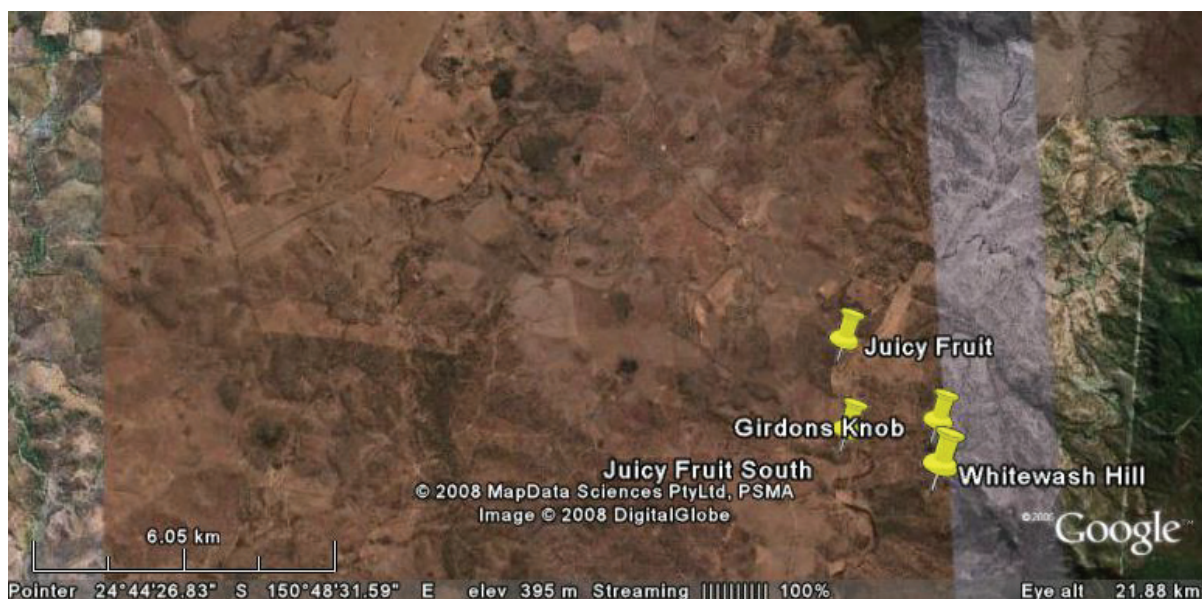
Figure 1. Map showing locations of satellite prospects in relation to Whitewash

A location map showing the positions of the closest satellite prospects to Whitewash is shown in Figure 1, and the drill hole collar locations are shown in Figure 2.